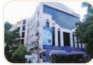
Elite Towers @ Raj Bhavan Road (Commercial Tower - 35000 sft)