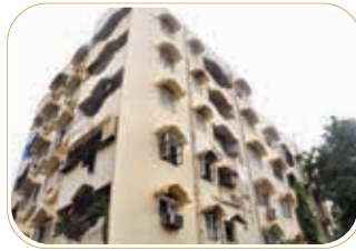
Elite Court @ Dharam Karan Road (Ameerpet) (Residential Tower - 30000 sft)