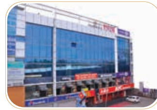
Prestige Towers @ MehdiPatnam, Pillar No. 4 (Commercial Tower - 45000 sft)