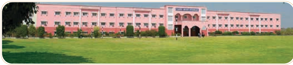
Farah Institute of Technology @ Chevella RR Dist. (3,00,000 sft)