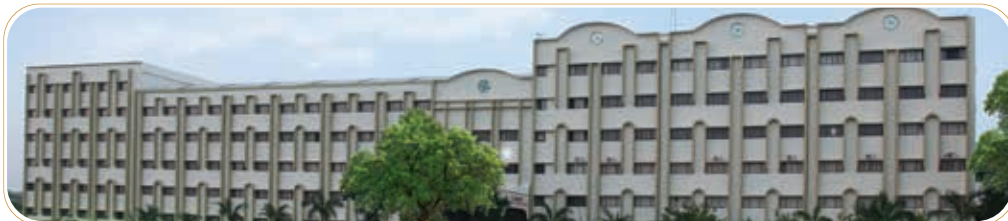
Lords Institute of Engineering & Technology @ Himayat Sagar, TSPA Junction (3,00,000 sft)

"This presentation is conceptual in nature and not by any means a legal offering. The promoters reserve the right to change, delete or add any specifications or plans mentioned herein."