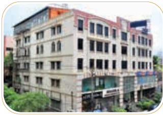
Elite Plaza @ Somajiguda Circle (Commercial Tower - 50000 sft)