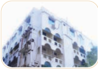
Elite Heights @ Raj Bhavan Road (Residential Tower - 25000 sft)