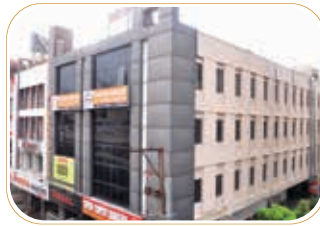
Elite Arcade @ Punjagutta, Road No.1, Banjara Hills (Commercial Tower - 35000 sft)