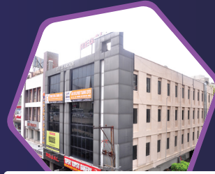
Elite Arcade @ Punjagutta, Road No.1, Banjara Hills (Commercial Tower - 35000 sft)