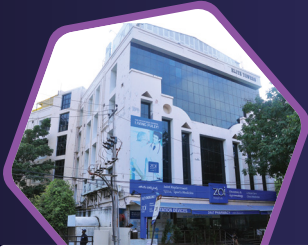
Elite Towers @ Raj Bhavan Road (Commercial Tower - 35000 sft)