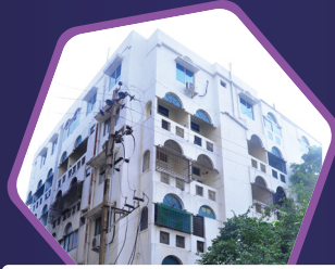
Elite Heights @ Raj Bhavan Road (Residential Tower - 25000 sft)