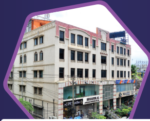
Elite Plaza @ Somajiguda (Commercial Tower - 50000 sft)