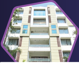
BMR Towers @ Shanti Nagar (Residential Tower - 25000 sft)