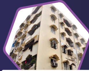
Elite Court @ Dharam Karan Road (Ameerpet) (Residential Tower - 30000 sft)