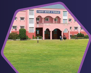
Farah Institute of Technology @ Chevella RR Dist. (3,00,000 sft)