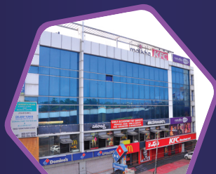
Prestige Towers @ Mehdiapatnam, Pillar No. 4 (Commercial Tower - 45000 sft)