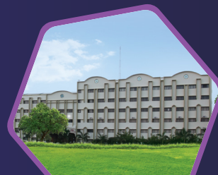
Lords Institute of Engineering & Technology @ Himayat Sagar, TSPA Junction (3,00,000 sft)

"This presentation is conceptual in nature and not by any means a legal offering. The promoters reserve the right to change, delete or add any specifications or plans mentioned herein."