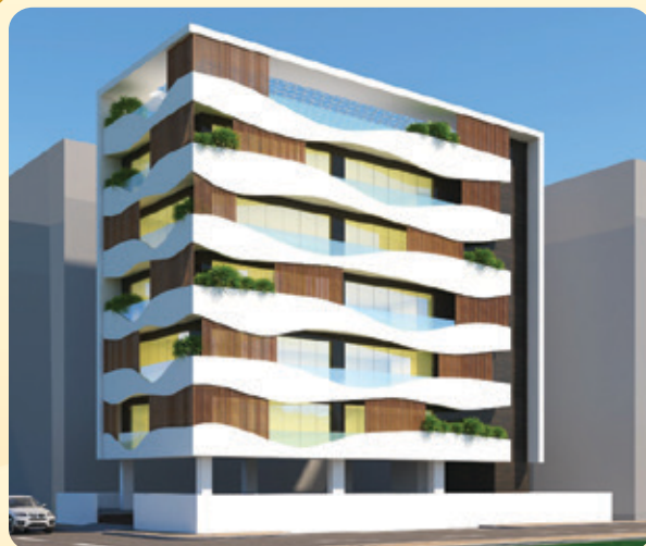
BMR Alpina @Kavuri Hills (Residential Tower - 15000 sft)