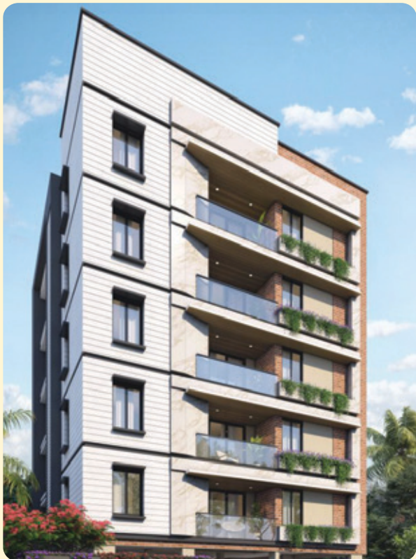
BMR Serenity @Kakatiya Hills (Residential Tower - 15000 sft)