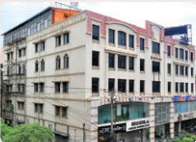
Elite Plaza @ Somajiguda Circle (Commercial Tower - 50000 sft)