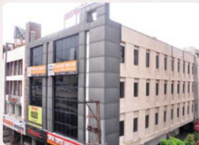
Elite Arcade @ Punjagutta, Road No.1, Banjara Hills (Commercial Tower - 35000 sft)