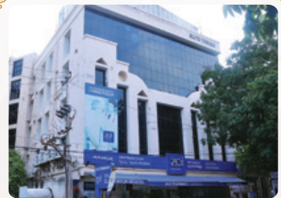
Elite Towers @ Raj Bhavan Road (Commercial Tower - 35000 sft)