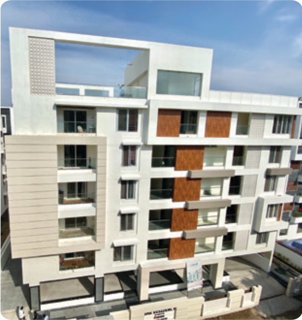
BMR Residency @Kakatiya Hills (Residential Tower - 25500 sft)