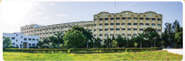
Lords Institute of Enggr @ Himayat Sagar, TSPA Junction (3,00,000 sft)