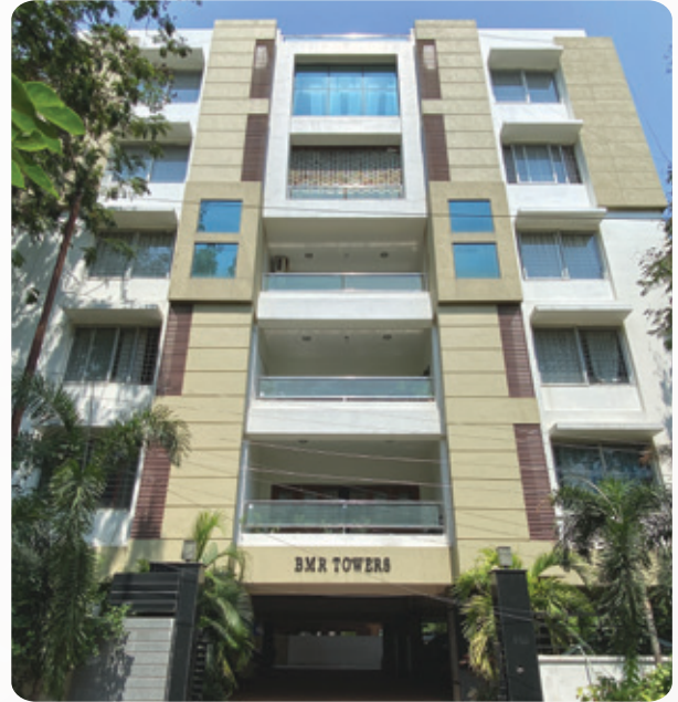
BMR Towers @Shanti Nagar (Residential Tower - 25000 sft)