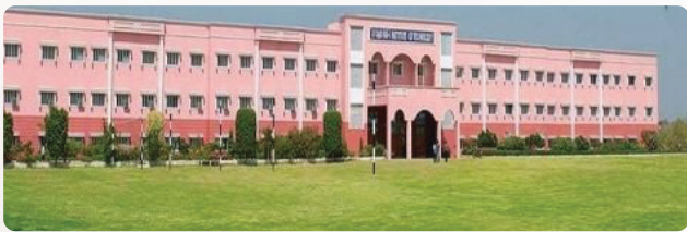
Farah Engineering College @ Chevella RR Dist. (3,00,000 sft)