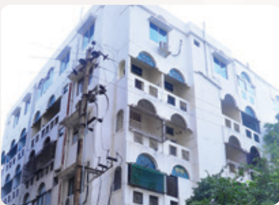
Elite Heights @ Raj Bhavan Road (Residential Tower - 25000 sft)