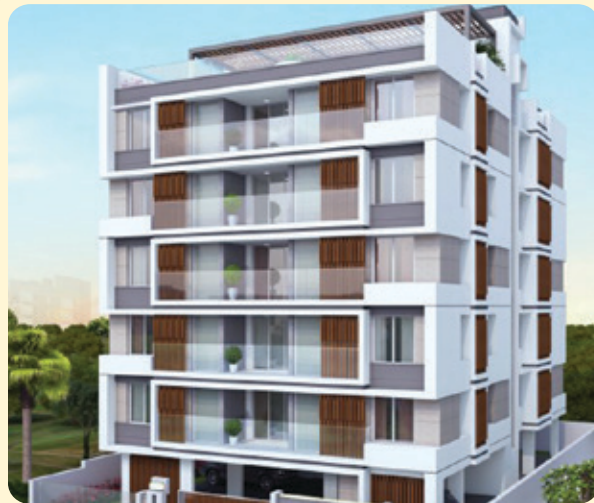
BMR Platina @Shanti Nagar (Residential Tower - 20200 sft)