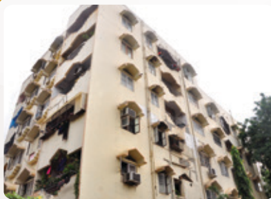
Elite Court @ Dharam Karan Road (Amberpet) (Residential Tower - 30000 sft)