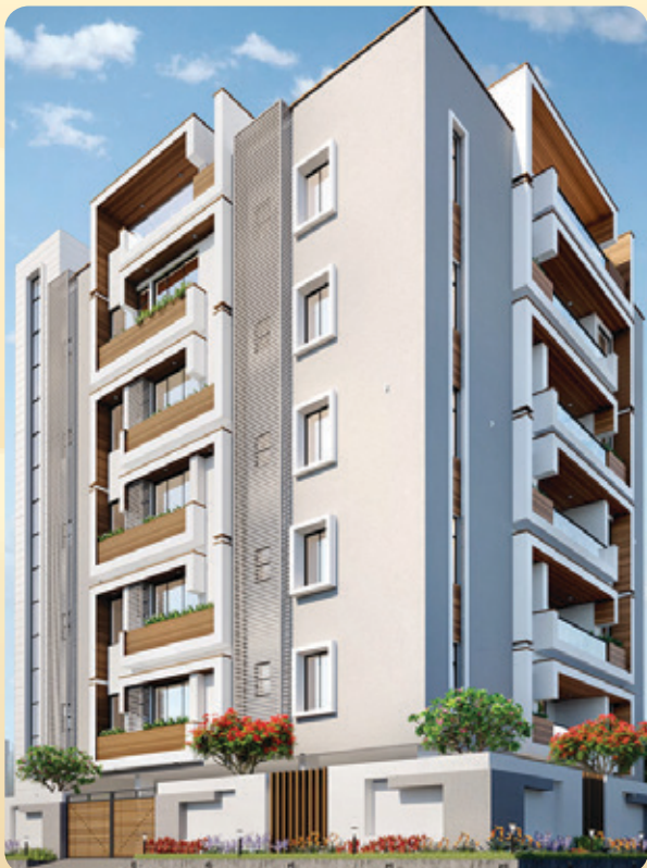
BMR Elegance @Kakateeya Hills (Residential Tower - 15000 sft)