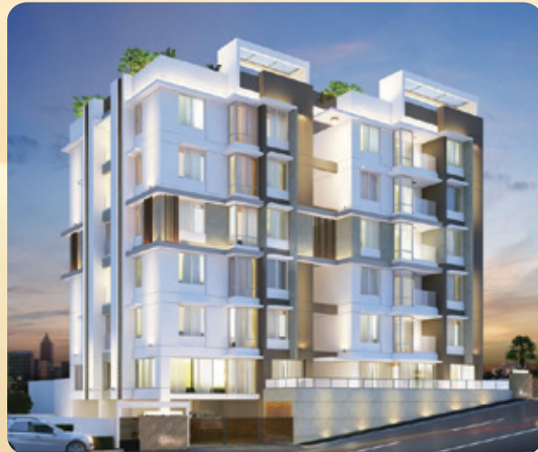
BMR Hillcrest @Humayun Nagar (Residential Tower - 27000 sft)